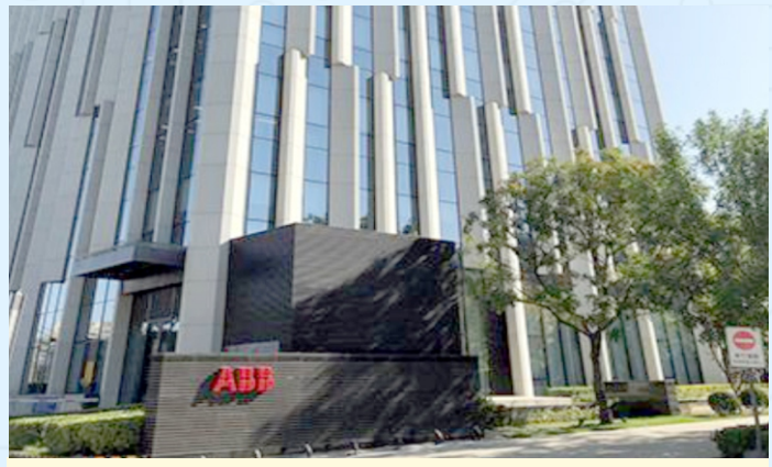
SANAPALA MANEESHA Roll No. 17711A0285, III EEE

It is a significant step forward in ABB's ongoing strategy of active portfolio management."ABB acquired a 60 per cent stake in the two joint ventures aspart of the GE Industrial Solutions acquisition in 2018. With the sale now complete, SGEG now owns the two Shanghai companies. ABB and SGEG will continue to operate as long-term partners via a multiyear mutual supply agreement. After decades of development, ABB has a full range of business activities in China. The company operates 44 local companies with nearly 20,000 employees located in more than 130 cities. China is ABB's second-largest market worldwide with more than 90 percent of sales from locally made products, solutions and services. ABB has invested more than US$2.4 billion in China since 1992.