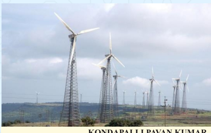
KONDAPALLI PAVAN KUMAR, Roll No. 16711A0233, IV EEE

By focusing on energy efficiency, renewable energy consumption and office space optimisation, the five markets have reduced their overall carbon emissions by 19 per cent in 2019. This includes a reduction of 33 per cent from non-industrial sites, 17 per cent from industrial sites, 32 per cent from business travel and 18 per cent from logistics. Signify offsets its remaining emissions through contributions to projects that have a positive environment